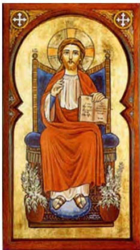
Our Lord and Saviour Jesus Christ, King of Kings and Lord of lords